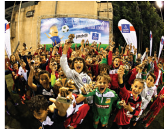
Pitch 22 tournament